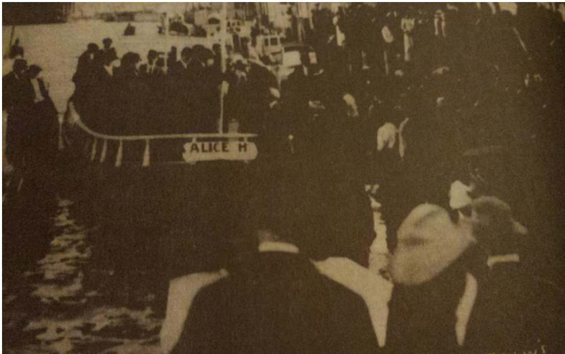
Illustration 2: The deportation of the IWW from Marshfield.