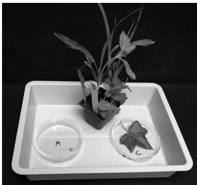
Figure 1. Plant specimens given to students for examination: (A) pea seed, (B) seedling mix, and (C) single freshly cut leaf.

Before beginning this exercise, instructors should introduce the concepts of structural complexity and criteria for being a living organism (Table 1). Typically I do this with a classroom discussion. I ask students