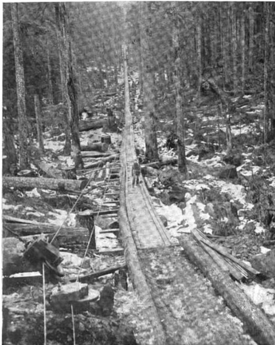
THE LOG CHUTE, LOOKING FROM THE BULL DONKEY.

society's just before, and shortly after, the turn of the 20 th Century 39 . Large scale logging operations of 30,000 plus acres were also forming along with the logging associations in order to control of vast timber lands under one owner and continued to merge and grow larger and expand their influence through the associations, and independently, into politics 40 . Starting around 1892, more advanced versions of the "Donkey Engine" were being produced for the logging industry. The "Bull Donkey", for example, was basically an oversized "Donkey Engine" with larger bores and longer strokes that could be, if desired, designed to function as a compound steam engine rather than a single piston design, which increased fuel efficiency.