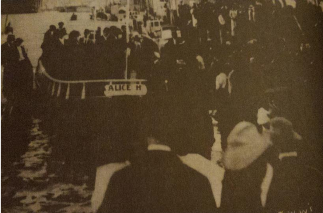
Illustration 2: The deportation of the IWW from Marshfield.