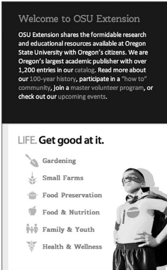
Figure 7. EESC Curated Web Spaces for "Get Good at It" How-to Communities

To further make the Stories and Stewardship Digital Curation Model a tangible reality for the citizens of Oregon, EESC extended the Extension Catalog into curated Web spaces, where stories are created for various communities of interest around such topics as gardening, small farms, food preservation, food and nutrition, family and youth, and health and wellness (see figure 7 from the OSU Extension website). Communities of interest now engage with Extension resources in Web spaces designed specifically around their needs.