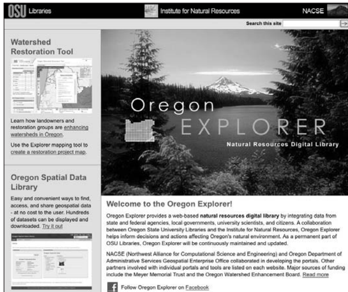
Figure 3. Oregon Explorer Website

natural resources digital library by way of accessing and integrating data from state and federal agencies, local governments, university scientists and citizens to support informed decisions and actions by people concerned with Oregon's natural resources and environment. 56 It is this "integrating data from state and federal agencies, local governments, university scientists and citizens" that informs the story creation aspect of digital curation within OE. 57