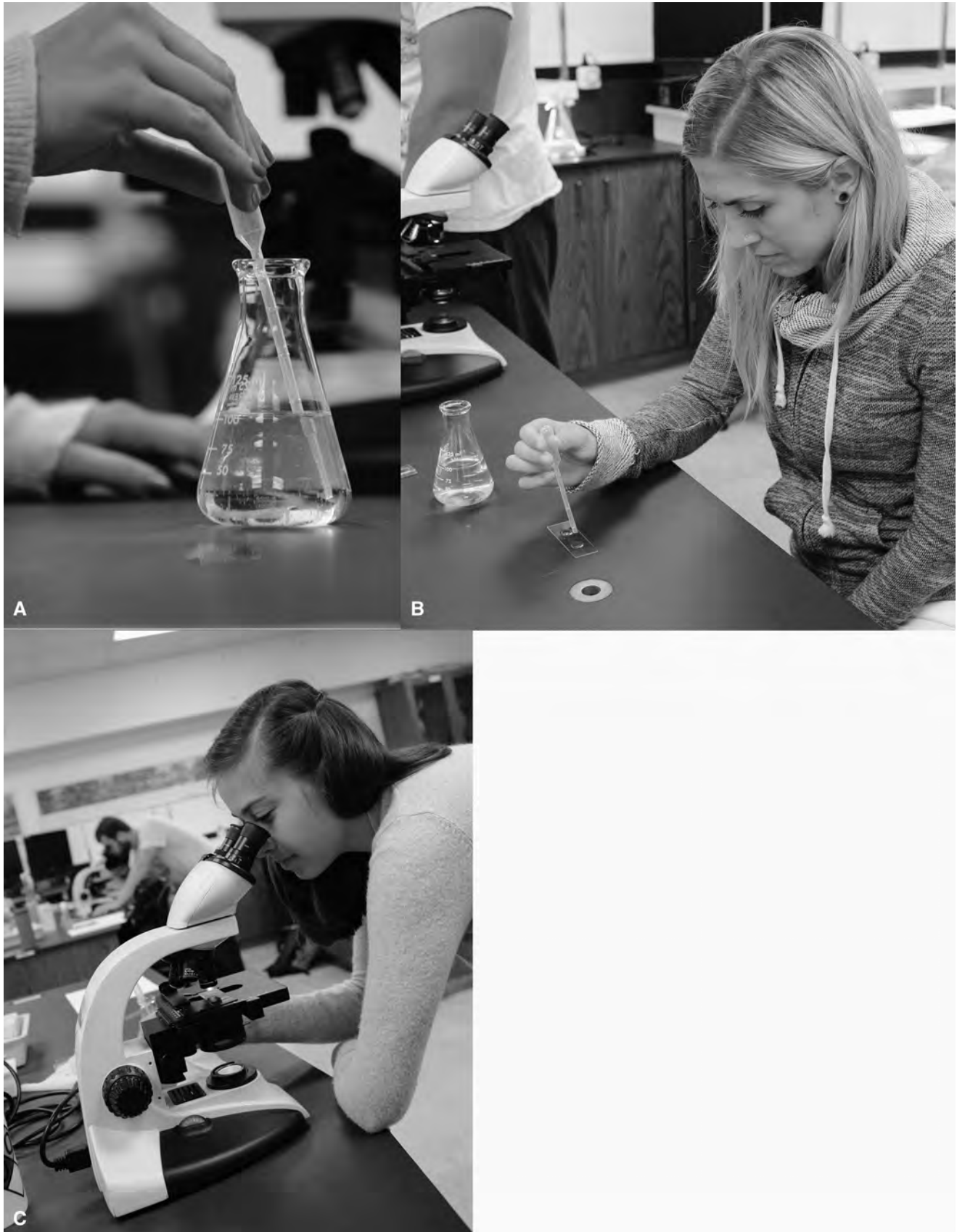
Figure 1. Students engaged in “Jar of Pond” sampling protocols: (A) removing a drop of pond water from plankton culture, (B) placing the drop on a microscope slide, and (C) counting plankton using microscopy.