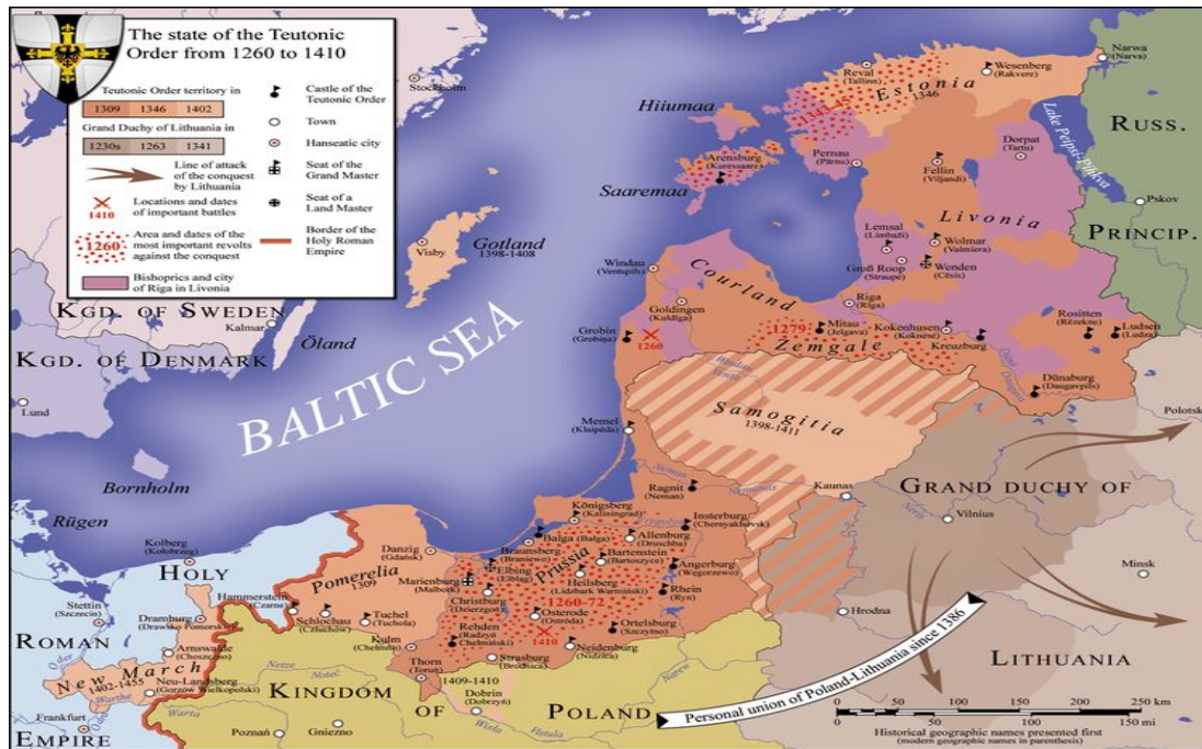
Figure 1: Map of the Baltic Region and Teutonic Order

https://www.ancient.eu/image/9295/northern-crusades-1260-1410-ce/