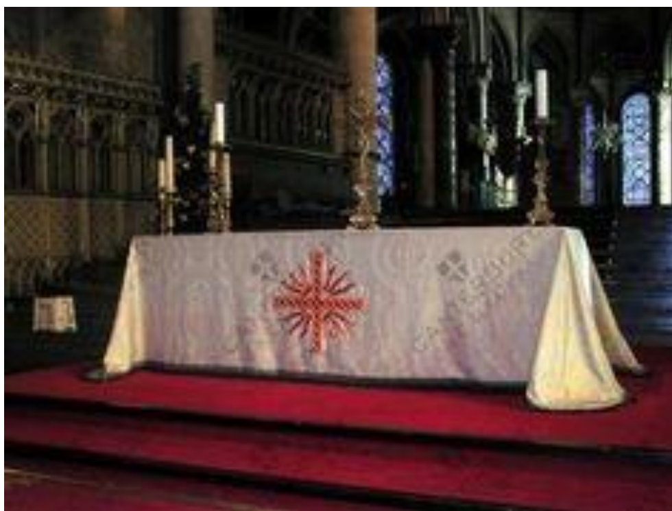
Figure 1 Communion Table at Canterbury Cathedral

https://ims.canterbury-cathedral.org/viewpicture.tlx?containerid=1146&pictureid=8036300