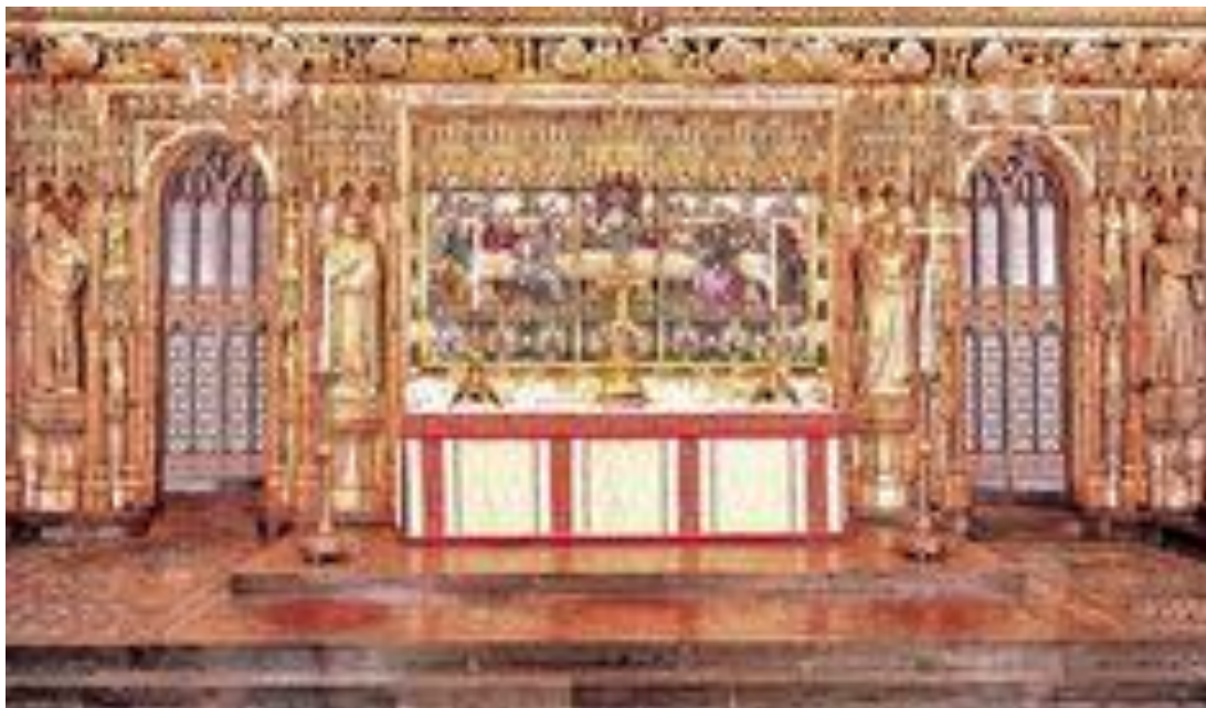
Figure 2 Altar at Westminster Abbey

http://www.westminster-abbey.org/our-history/people/victor-bruce.-9th-earl-of-elgin