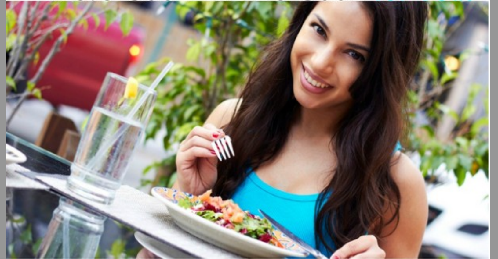
Thrills of good communication skills