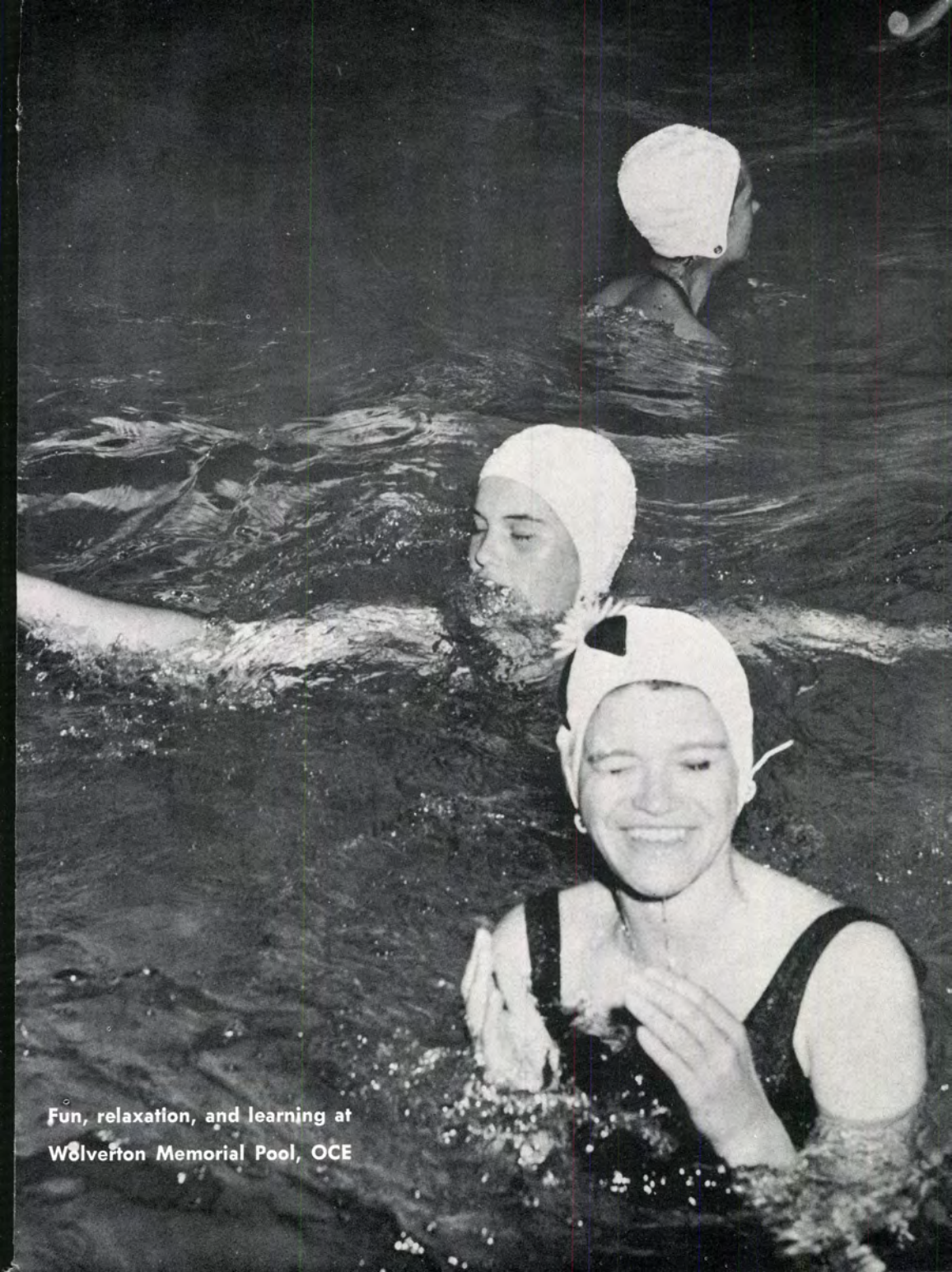
Fun, relaxation, and learning at Wolverton Memorial Pool, OCE