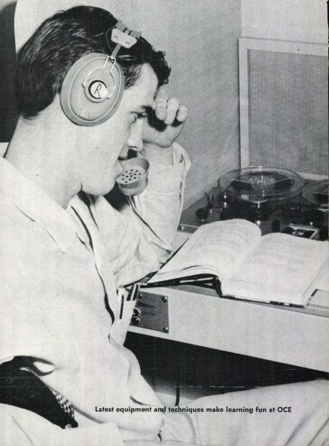
Latest equipment and techniques make learning fun at OCE