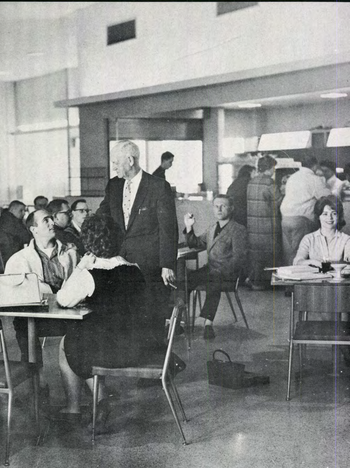
Informality is the keynote in the OCE Student Center Coffee Shop