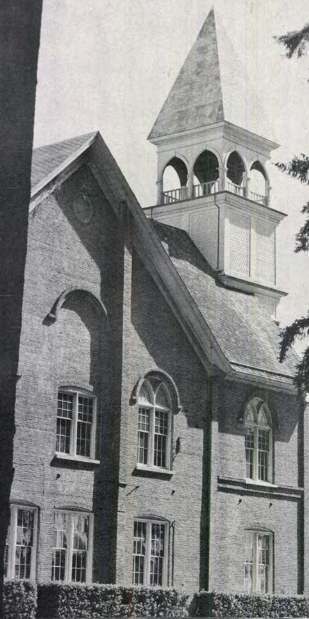
Historic Campbell Hall Tower—Destroyed in Columbus Day Storm, 1962