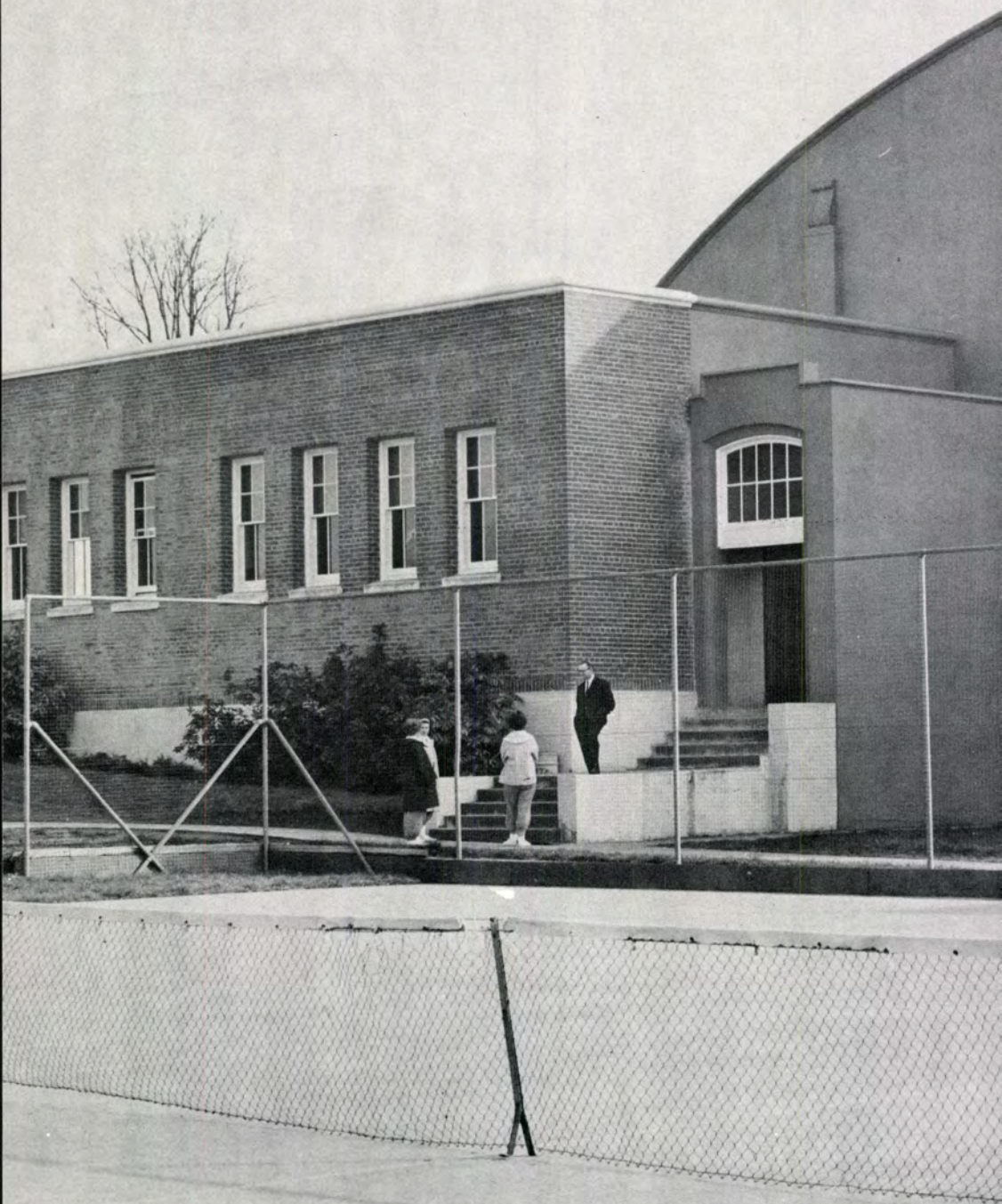
A modern health and physical education plant centers OCE Sports