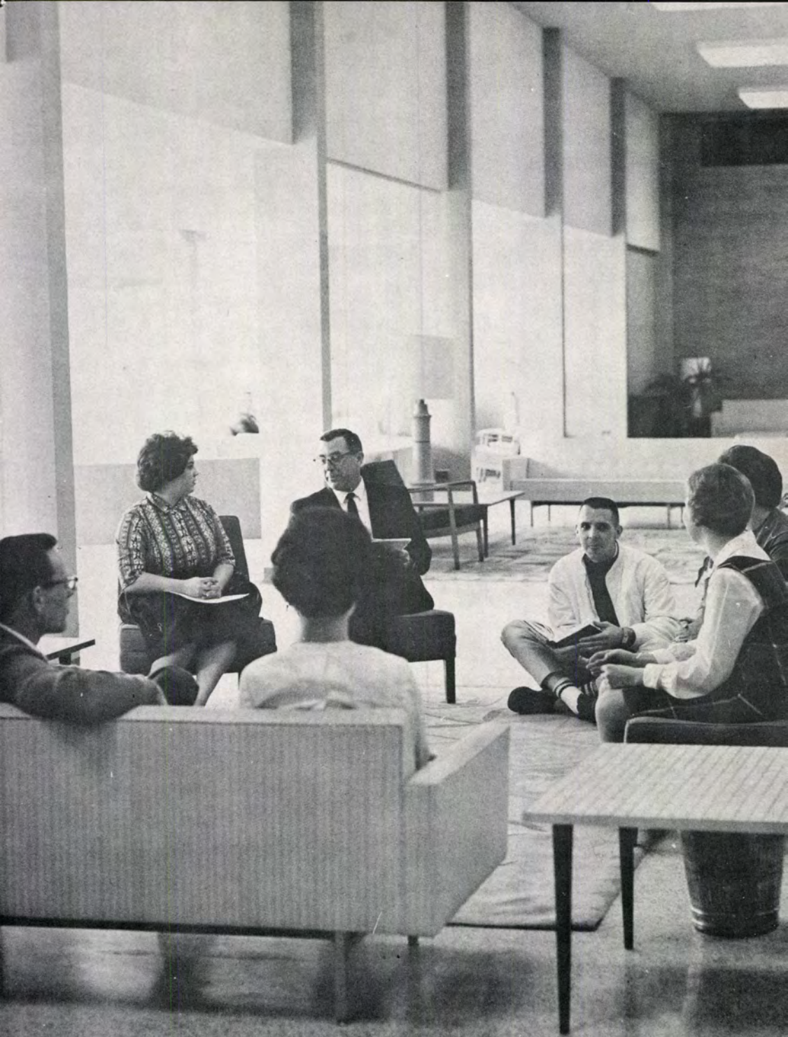
Informal talks highlight small college atmosphere at OCE