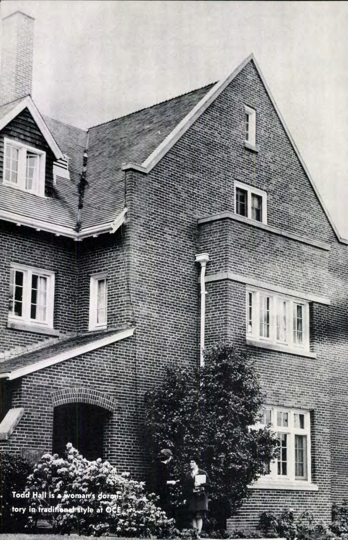
Todd Hall is a woman's dormitory in traditional style at OCE.