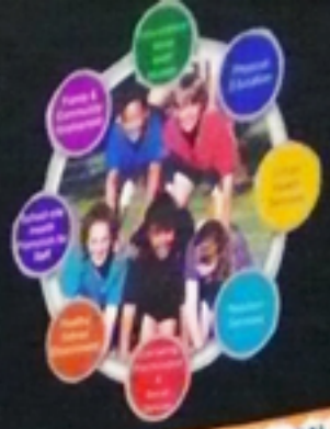
HEALTH SERVICES & EDUCATION - HEALTH CENTER COUNSELING