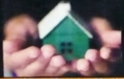
LIVING ARRANGEMENTS - STUDENTS ABLE TO CHOOSE WHERE THEY WANT LIVE: SCHOOL, HOME, OR APARTMENT LOCATED NEAR SCHOOL AREA.