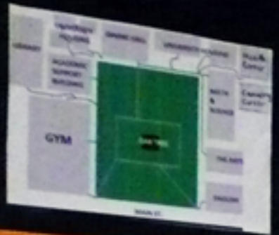
LAYOUT OF CAMPUS - SMALL CAMPUS SURROUNDING COURTYARD