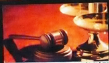
JUDICIAL AFFAIRS - PRIVACY FOR STUDENTS. STUDENTS ARE TRUSTED IN THAT THEY WILL RESPECT THE SCHOOL POLICIES, IF NOT FOLLOWED COMMITTEE WILL TAKE ACTION. A COMMITTEE OR STAFF THAT WILL DETERMINE PUNISHMENT MORE LIKELY AS A JURY DOES.