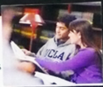
ADVISORS/ AS WELL AS ADVISORS WITHIN STUDENTS MAJOR TUTORING- THIS CAN BE STUDENT TO STUDENT OR ANY OTHER FACULTY.