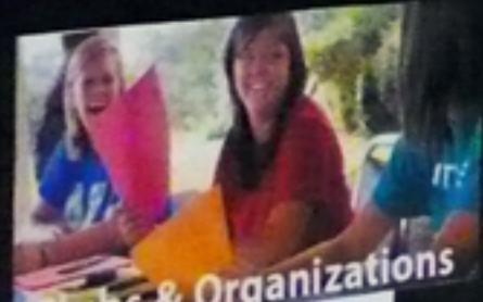
Clubs & Organizations CLUBS & ORGANIZATIONS - MULTICULTURAL CLUBS STUDENTS START FRATS OR SORORITIES & HAVE OWN PLACE OF LIVING STUDENTS START CLUBS - STUDENT RAN