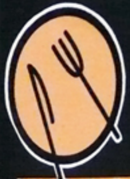
CAMPUS DINING - ON CAMPUS DINING SIMILAR TO VALSETZ + OTHER CHOICES RIGHT OUTSIDE OF CAMPUS FOR VARIETY OF FOOD AND TO GENERATE JOBS FOR STUDENTS.